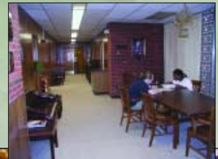
George J. Goodman Foyer