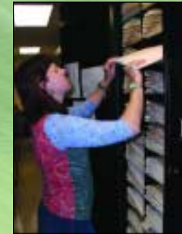
Vascular plant collections