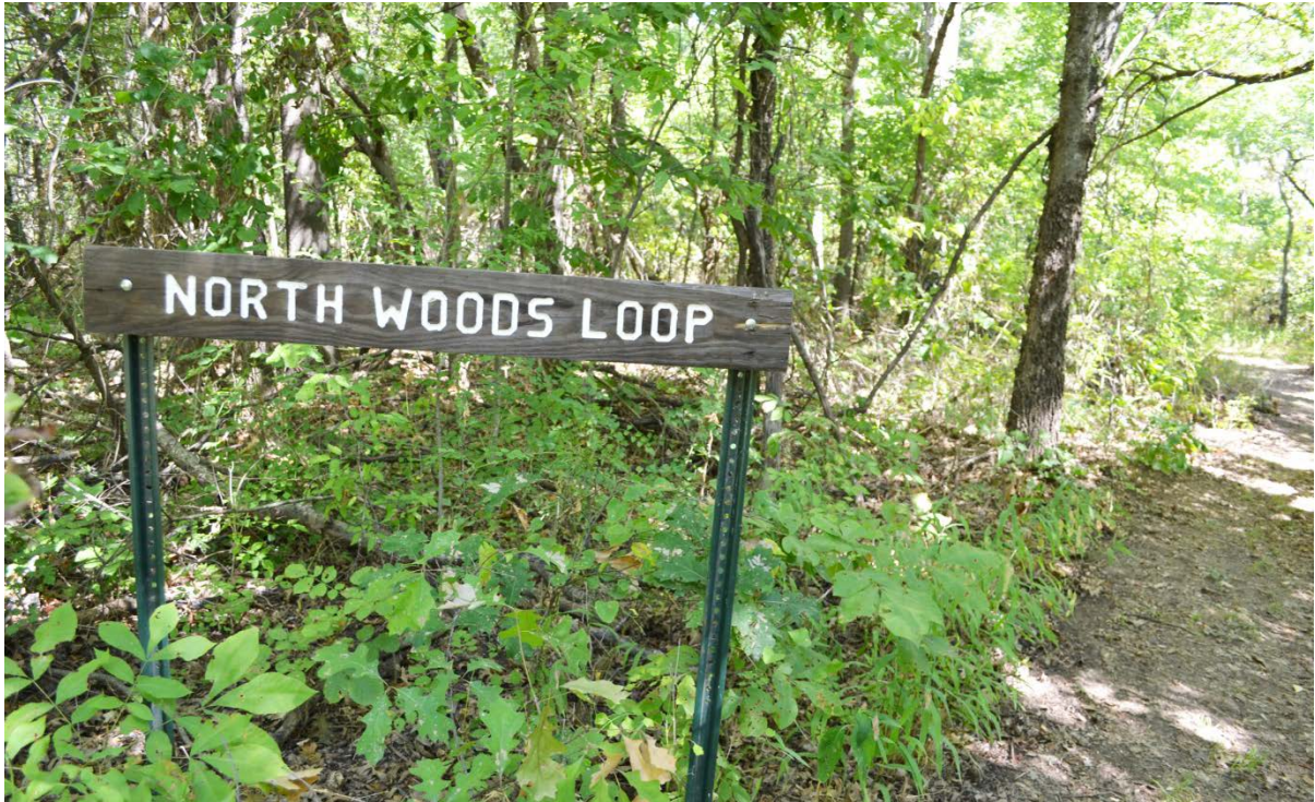
Figure 1 Mesic forest in North Woods Loop at the Mary K. Oxley Nature Center, Tulsa County, Oklahoma