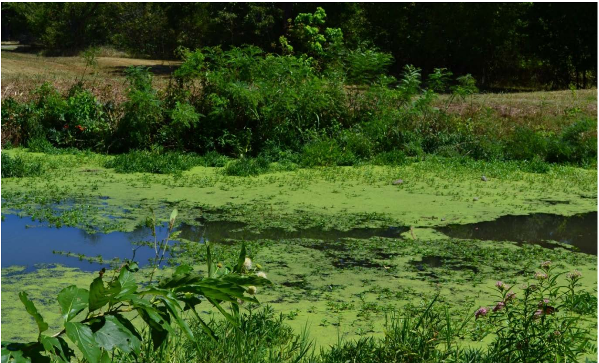
Figure 4 Wetland and aquatic vegetation in Nelson's Oxbow at the Mary K. Oxley Nature Center