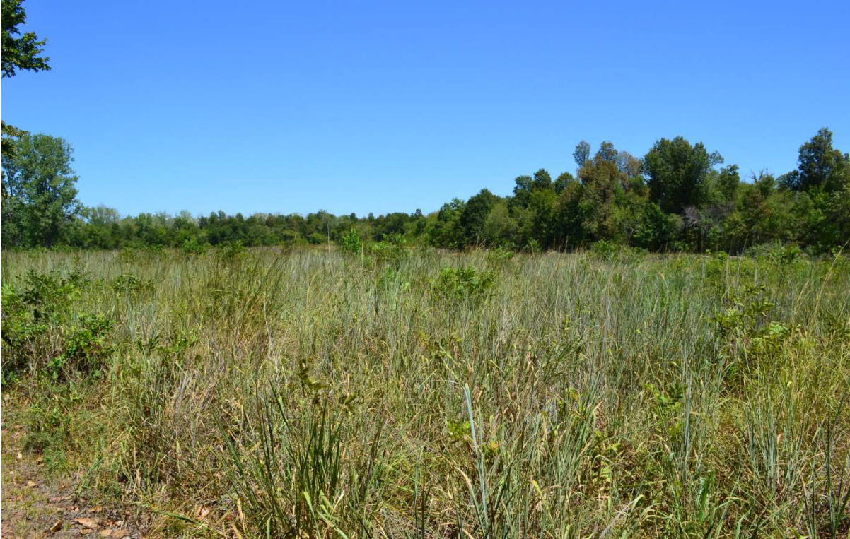
Figure 3 Disturbed herbaceous vegetation in Meadowlark Prairie at the Mary K. Oxley Nature Center