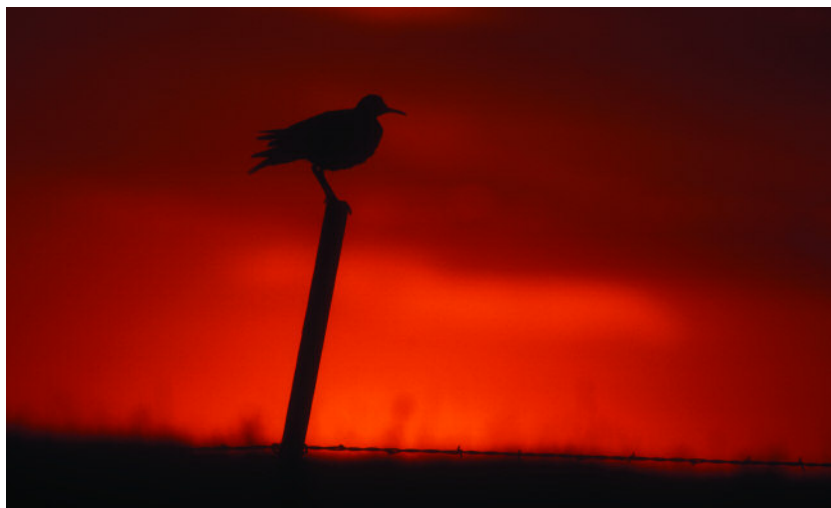
Although significant political and logistical hurdles lie ahead, there is reason to be hopeful about the future of the tallgrass prairie and its avian inhabitants. The Upland Sandpiper is an example of a species that has persisted in the agricultural landscape and whose population in the tallgrass prairie is not in decline. North Dakota; July 2003.

grassland to forest in the absence of fire, and no longer meets the requirements of most grassland birds. Effective management of the remaining grasslands will be vital if we are to sustain bird populations. What, then, can be done to manage for grassland birds, considering that most of the remaining tracts of native tallgrass prairie are privately owned? Outreach efforts by extension agents and neighboring landowners promoting the use of regular fire for restraining woody invasives are needed in some areas where fire is underutilized. At the other management extreme, recent research suggests a potential replacement for IES as a way to profitably manage tallgrass prairie for cattle production, while providing needed habitat diversity for birds. Called patch burning, this technique involves burning roughly one-third of a given area each year, rather than an entire pasture (Fuhlendorf and Engle 2001). The burned areas serve as intense focal points for grazing, and early indications are that herbivores may show weight gains