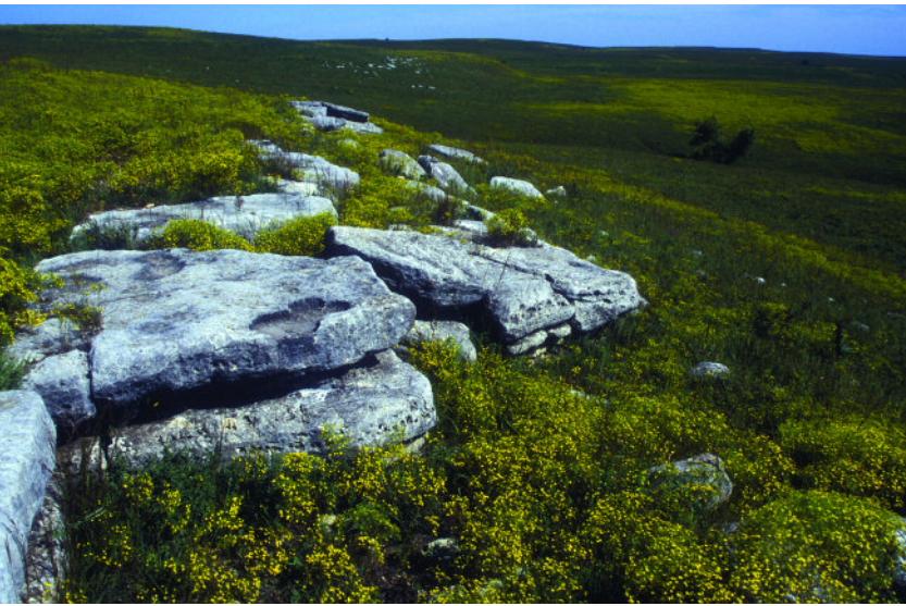
This lush, never-plowed grassland retains its native plants and birds, and is maintained by regular fires. Flint Hills, Kansas; October 2001.

Sparrows can readily colonize new areas of appropriate habitat as fires render breeding areas unavailable from one year to the next. Widespread and consistent application of IES in much of the Flint Hills keeps appropriate habitat for Henslow's Sparrow in short supply, although large numbers of birds are present where suitable habitat exists at Konza Prairie in Kansas and the Tallgrass Prairie Preserve in Oklahoma, at the northern and southern portions of the Flint Hills, respectively. Avian diversity is lower in annually burned Kansas prairie, in part because woody vegetation used by some species is removed, leaving behind a structurally simpler habitat capable of supporting fewer species (Zimmerman 1997). In Illinois grasslands, Northern Harriers prefer unmanaged (by fire, grazing, or mowing) grasslands in which to nest, whereas Short-eared Owls nest only in managed grasslands (Herkert et al. 1999). This is further evidence of the need for a variety of successional stages within the tallgrass prairie if it is to support the full complement of grassland bird species.