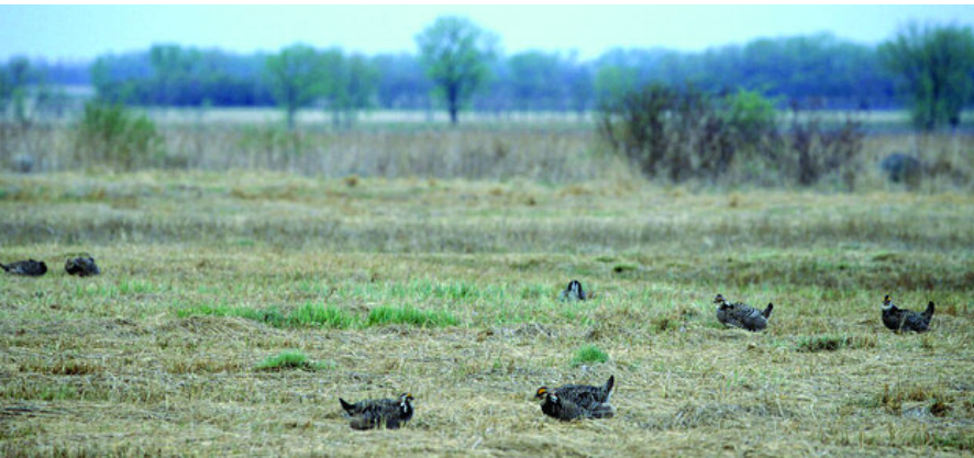
Early nesters, such as the Greater Prairie-Chicken , may lose their nests to spring fires. Clay County, Minnesota; May 2001.