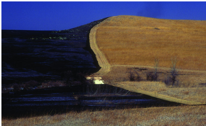
Natural tallgrass prairie fire regimes are variable in time and space, creating a mosaic of habitats, although current management practices frequently overemphasize or de-emphasize fire. Konza Prairie; April 1994.

increased insect abundance providing a cue suggesting high-quality nesting habitat, but they subsequently suffer high nest failure rates because nest predators are also more common there, then burned prairie ultimately acts as an ecological trap for Dickcissels. Stated simply, burned prairie is perceived by Dickcissels as higher quality habitat than it really is, and as a result has a high density of breeding individuals that ultimately have low nest-success rates, while adjacent areas of unburned prairie have lower densities of breeding Dickcissels even though the birds there actually experience higher reproductive success. This imbalance means that the Dickcissel population is not reproducing at its full potential in areas where a disproportionate amount of habitat is burned in a given year. Evidence of this type of trap also exists for Eastern