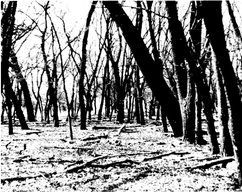
Oliver Wildlife Preserve near Norman

contains many southern floral elements. It is between the humid east and arid west and the cold northern temperatures and warm southern temperatures.