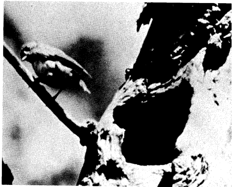
A tufted titmouse near its nest in a hollow tree trunk in the Oliver Wildlife Preserve near Norman.

Soon it will be spring, the ponds will flood, the green ash trees will sprout and budding ecologists will note more changes in Oliver's Woods.